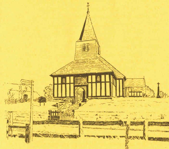
The C13th Church of St James and St Paul, Marton